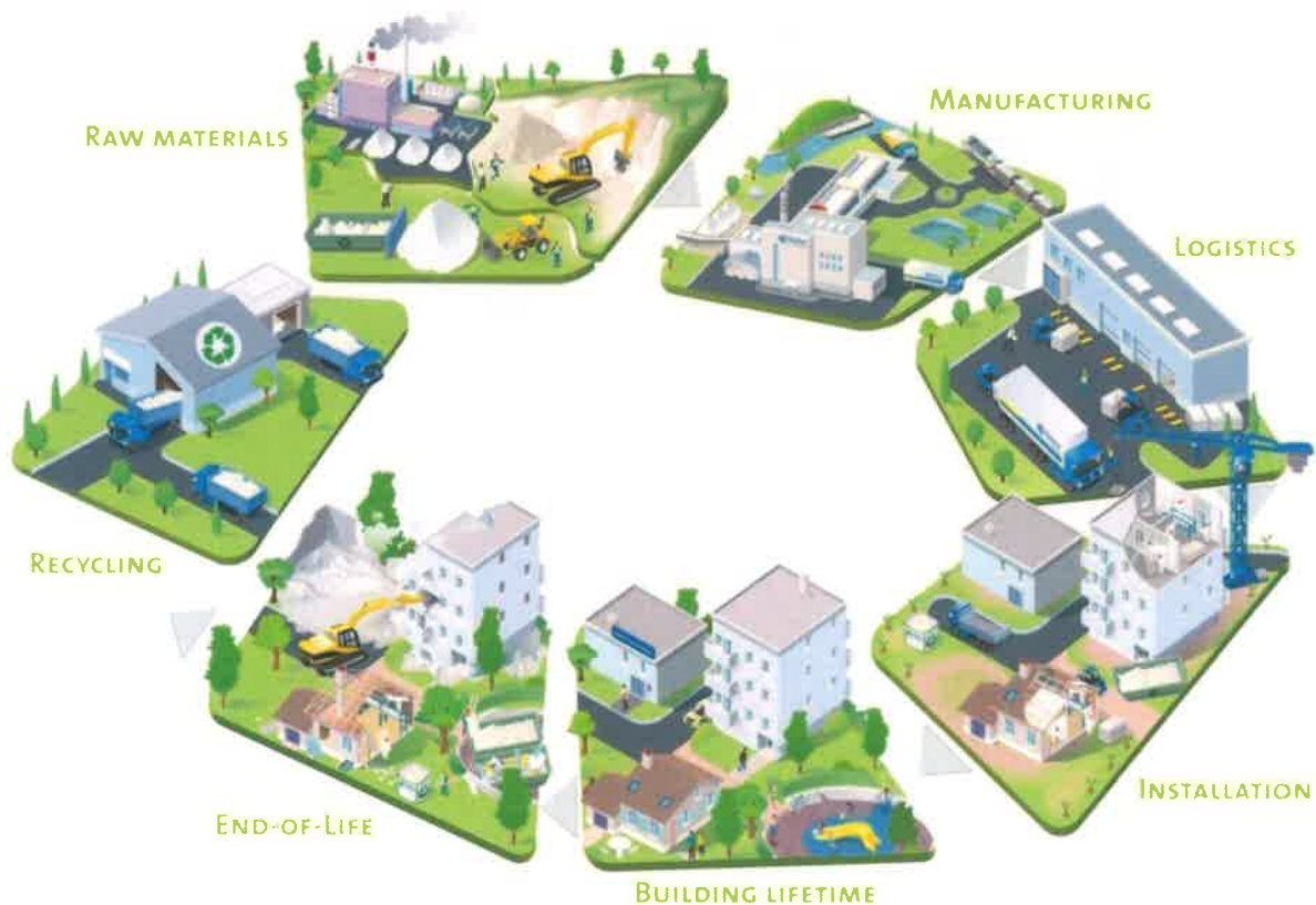
Flow diagram of the Life Cycle